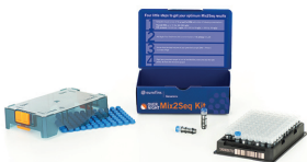
Mix2Seq Kit - OVERNIGHT